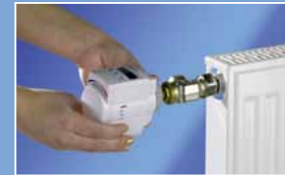
Screw on SPARmatic