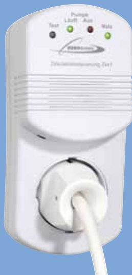
ZKS1 energy-saving system for circulation pipes