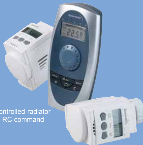
SPARmatic premium set with two radio-controlled-radiator thermostats and RC command unit

programmable energy-saving control for radiators