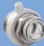
AIRless automatic de-aerator for radiators