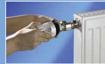
Unscrew the old thermostat

Easily without tools and without grime because the hot water circuit is not opened and thus no water can escape.