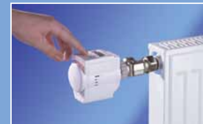
A self-test is running and SPARmatic is ready to operate in its basic programme

If you move, simply take SPARmatic with you.